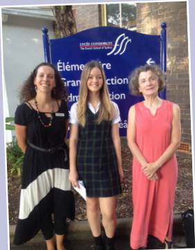
At Lycée Condorcet

See all program details including dates, year groups and approximate costings inside this brochure.